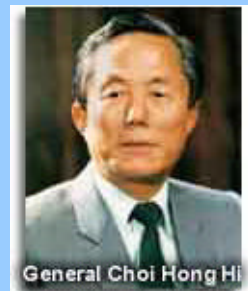
General Choi Hong Hi

courtesy integrity perseverance self control